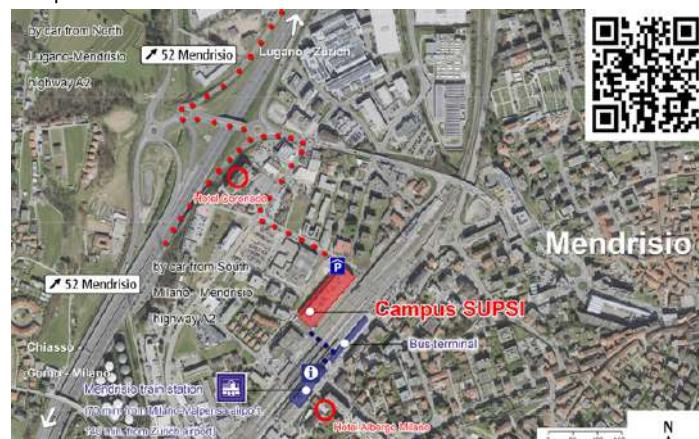
SUPSI Campus Mendrisio-Stazione