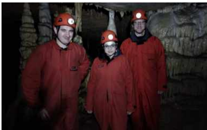
Visiting Križna cave

What is really exciting about research is that it always reserves you the emergent and the unexpected. When I arrived in Postojna, I believed that the focus of my research would be an in-depth understanding about the governance and management of the amazing Underground Built Heritage (UBH) of Postojna show cave. Once on the field, however, I realized that it is hard to consider it as a “best practice” for catalyzing Community Valorisation. Indeed, although