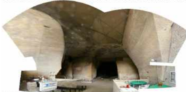
Interior view main gallery