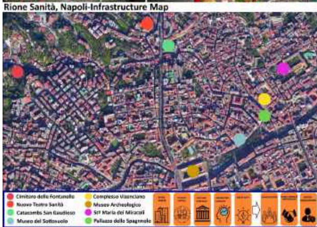
Rione Sanità, Napoli-Infrastructure Map