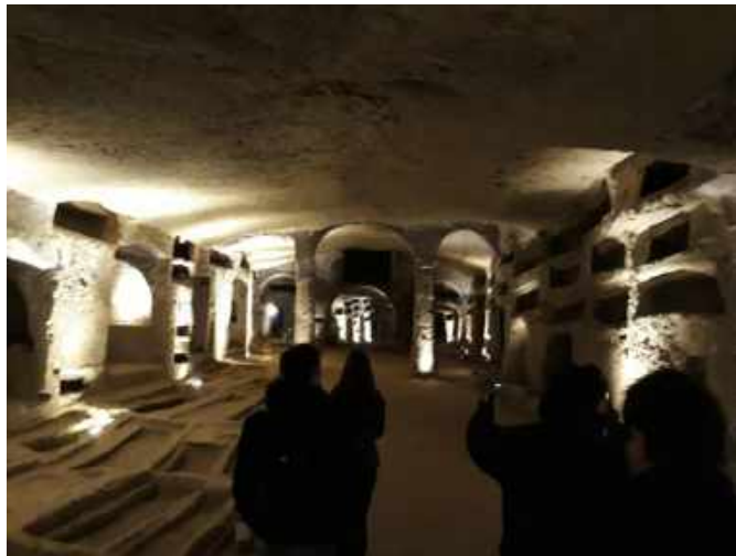
Catacombs of San Gennaro (Naples)

to both touristic valorisation and exploitation. Over time, many underground routes have been opened to the public becoming more and more popular and visited. In that regard, the catacombs of San Gennaro and the catacombs of San Gaudioso are two virtuous examples of cultural tourism developed by a project of recovery of underground historical sites. They are paleo-Christian burials restored and managed (Catacombs of San Gaudioso in