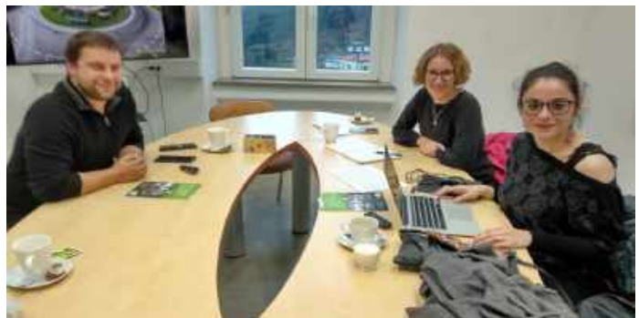
Meeting at the Park of Military History