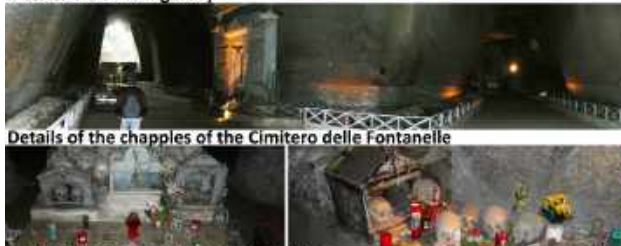
Details of the chapels of the Cimitero delle Fontanelle