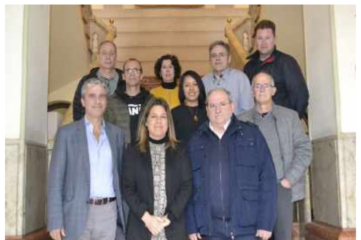
Living Lab meeting