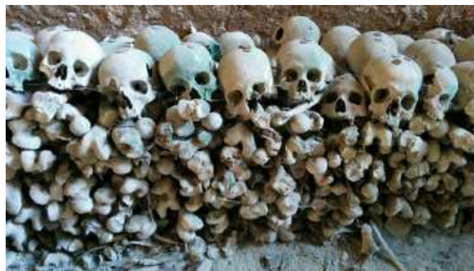
Fontanelle Cemetery (Naples)

2006; Catacombs of San Gennaro in 2008) by a cooperative of young people, "La Paranza" of the Rione Sanità, one of the most ancient and poorest areas of the city. Given the precarious situation of the district, La Paranza's program can be properly considered a social experiment, and demonstrate that underground built heritage has the potential to become a resource for local communities.